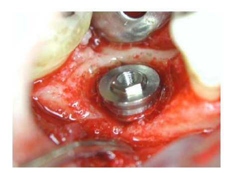
Fig. 20. Granulation tissue and exudate around implant fixture.