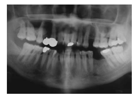
Fig. 6. Preoperative radiograph.