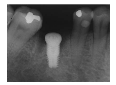
Fig. 22. Postoperative radiograph shows healing.

implant, and it was not necessary to contour the osseous crest. The flap was closed with the healing abutment in place. Fig. 22 is a 1-month radiograph that demonstrates good healing.