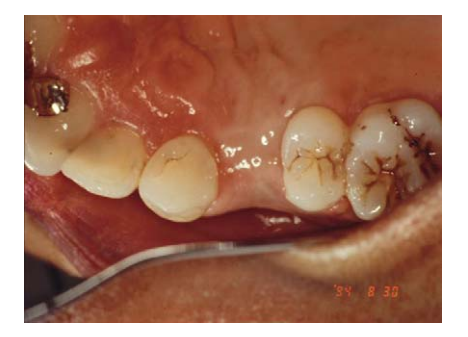
Fig. 7. Six-month postimplant placement. Note the adequate zone of keratinized tissue.