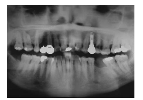
Fig. 13. Follow-up radiograph 1 year in function.